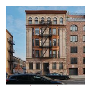
Bed-Stuy Package $8,275,000