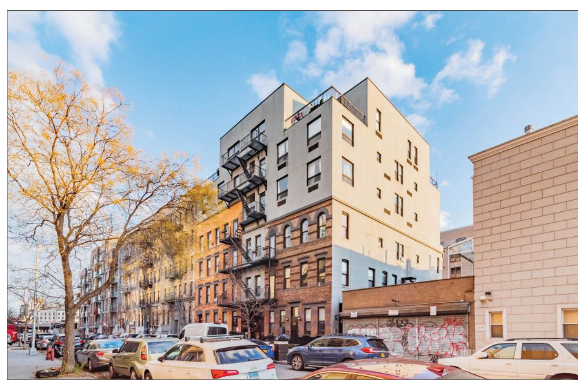
68 Richardson St. is a six-story, 25-unit apartment community located in the Williamsburg neighborhood of Brooklyn, New York. Built in 1910, the property features a community roof deck and elevator.

Meanwhile, developers are increasingly running into roadblocks when it comes to building new stock. The state legislature allowed the Affordable New York program, more commonly known as the 421-a tax abatement program, to expire on June 15. With no clear road to reform or replacement, many developers are concerned about the financial feasibility of building new units in NYC.