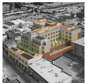
New Construction Multifamily $21,500,000