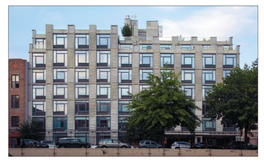
248 North 8th St. is located in the Williamsburg neighborhood of Brooklyn, New York. The property was built in 2014 and has seven stories and 104 units.

Sources: U.S. Census Bureau, New York Department of Labor, U.S. Department of Housing and Urban Development, Yardi Matrix, Marcus & Millichap