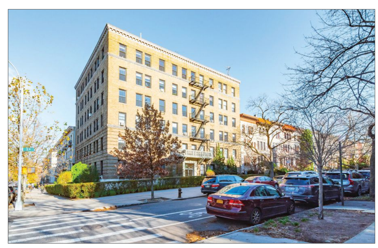
Located in the Park Slope neighborhood of Brooklyn, New York, 575 3rd St. is a six-story, 36-unit property. Built in 1920, units feature pre-war design and hardwood floors throughout.

Since its inception, 421-a has been used in nearly every big residential project in NYC, subsidizing the construction of hundreds of thousands of market-rate apartments across the city.