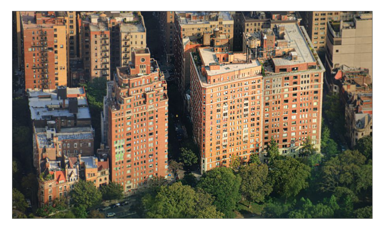
BlackRock has sold a 125-unit building on the Upper West Side of Manhattan at 98 Riverside Drive near West 82nd St. for $90 million.

Though it typically required developers to build some below-market, affordable multifamily rentals, critics of the program have pointed out that most of the income-restricted units are unaffordable to a vast majority of city dwellers,