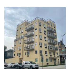
Flatbush Multifamily $8,250,000