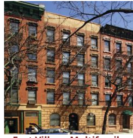
East Village Multifamily $5,250,000