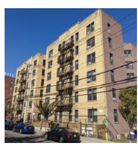
Queens Portfolio $27,000,000