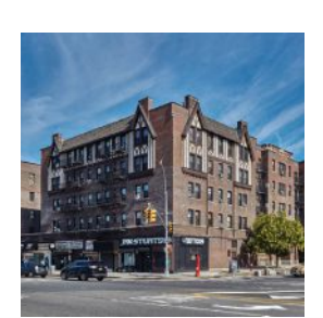
Bronx Multifamily $25,000,000